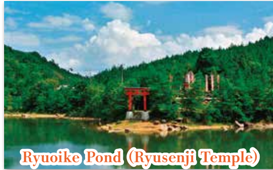
Ryuoike Pond (Ryusenji Temple)