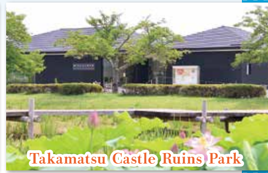
Takamatsu Castle Ruins Park