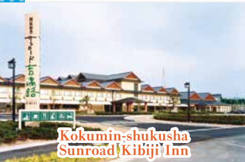
Kokumin-shukusha Sunroad Kibiji Inn