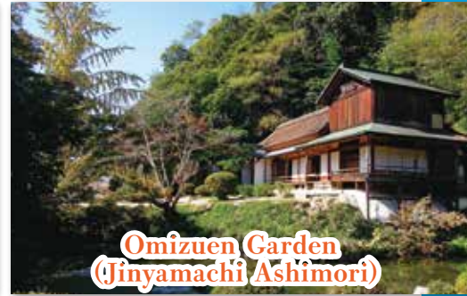
Omizuen Garden (Jinyamachi Ashimori)