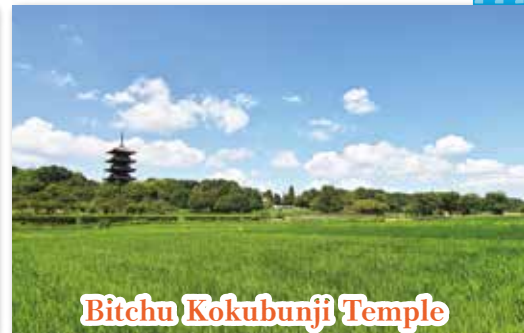
Bitchu Kokubunji Temple